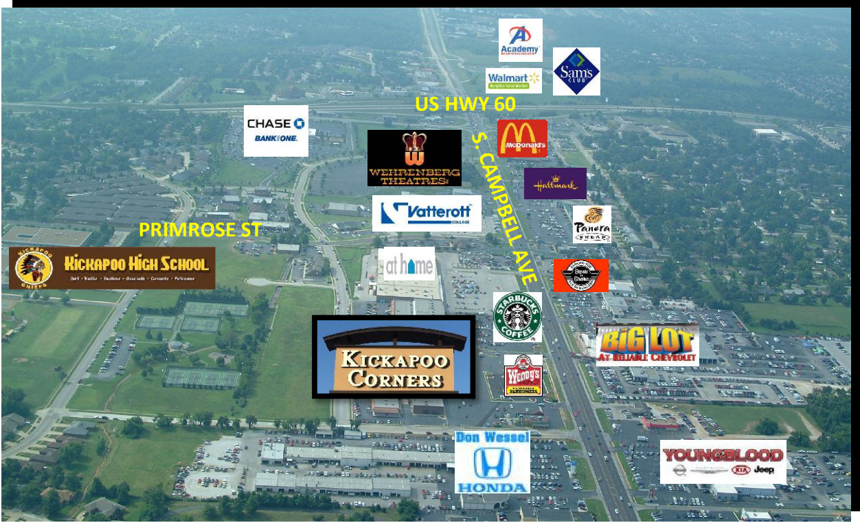
Kickapoo Corners View to the South